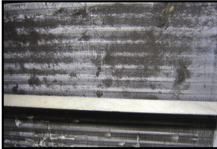
Coil soaking in solution